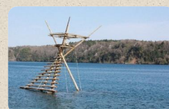
10 Wakura Onsen