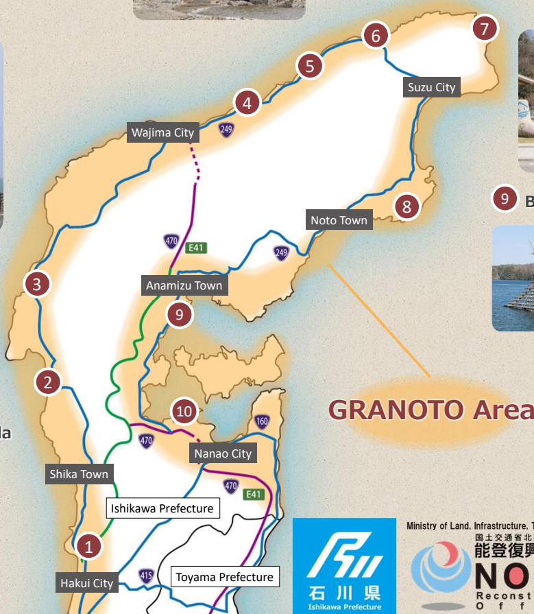
9 Bora-machi Yagura